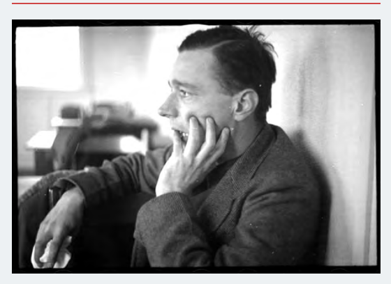
Walker Evans, profile, hand up to face, 1937.

Walker Evans began to photograph in the late 1920s, making snapshots during a European trip. Upon his return to New York, he published his first images in 1930. During the Great Depression, Evans began to photograph for the Resettlement Administration, later known as the Farm Security Administration (FSA), documenting workers and architecture in the Southeastern states (fig. 2). In 1936 he traveled with the writer James Agee to illustrate an article on