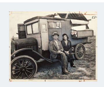
Cat. 2. Pea Pickers, Nipomo, California