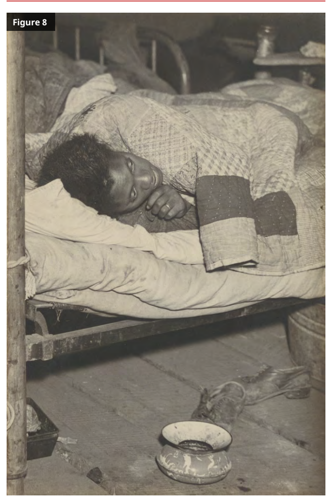
Walker Evans. Arkansas Flood Refugee , 1937. The J. Paul Getty Museum, Los Angeles

For the book, however, Evans chose a vertically oriented print from another negative of the sleeping woman mentioned above. This image (fig. 8), which might seem more invasive than intimate, is even more startling and unorthodox than the first. It presents the weary flood victim at bedside level, awake but nestled under the guilt. Below her on the floor of the old cotton warehouse that is supplying emergency shelter are a few items of clothing and a bedpan. Occurring at almost the exact center of the book—that is, as plate forty-four in a sequence of eightyseven images—it falls between a van Gogh-like interior entitled Hudson Street Boarding House Detail, New York and a portrait of three working-class neighbors passing the time together in People in Summer, New York State Town. As comparative material from this winter of 1937 Arkansas assignment, three other prints in the Getty collection depict African American women displaced by the flood and huddled in or near a bed due to cold and illness. Like the two images chosen for the MoMA show, these three reflect substantial cropping of the negatives in an effort to close