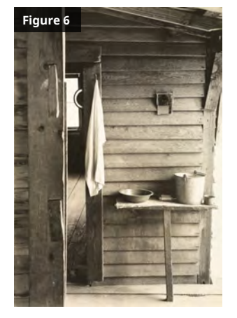
Walker Evans. Washroom in the Dog Run of the Burroughs Home, Hale County, Alabama, 1936. The J. Paul Getty Museum, Los Angeles